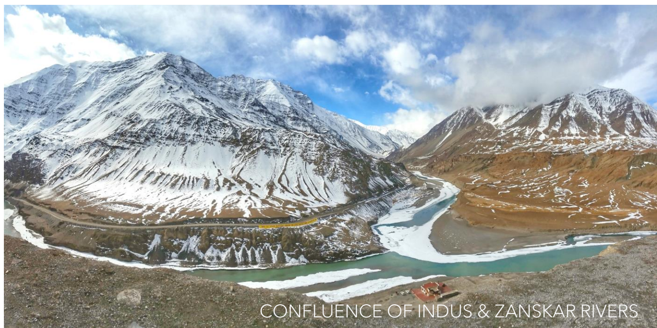
CONFLUENCE OF INDUS & ZANSKAR RIVERS