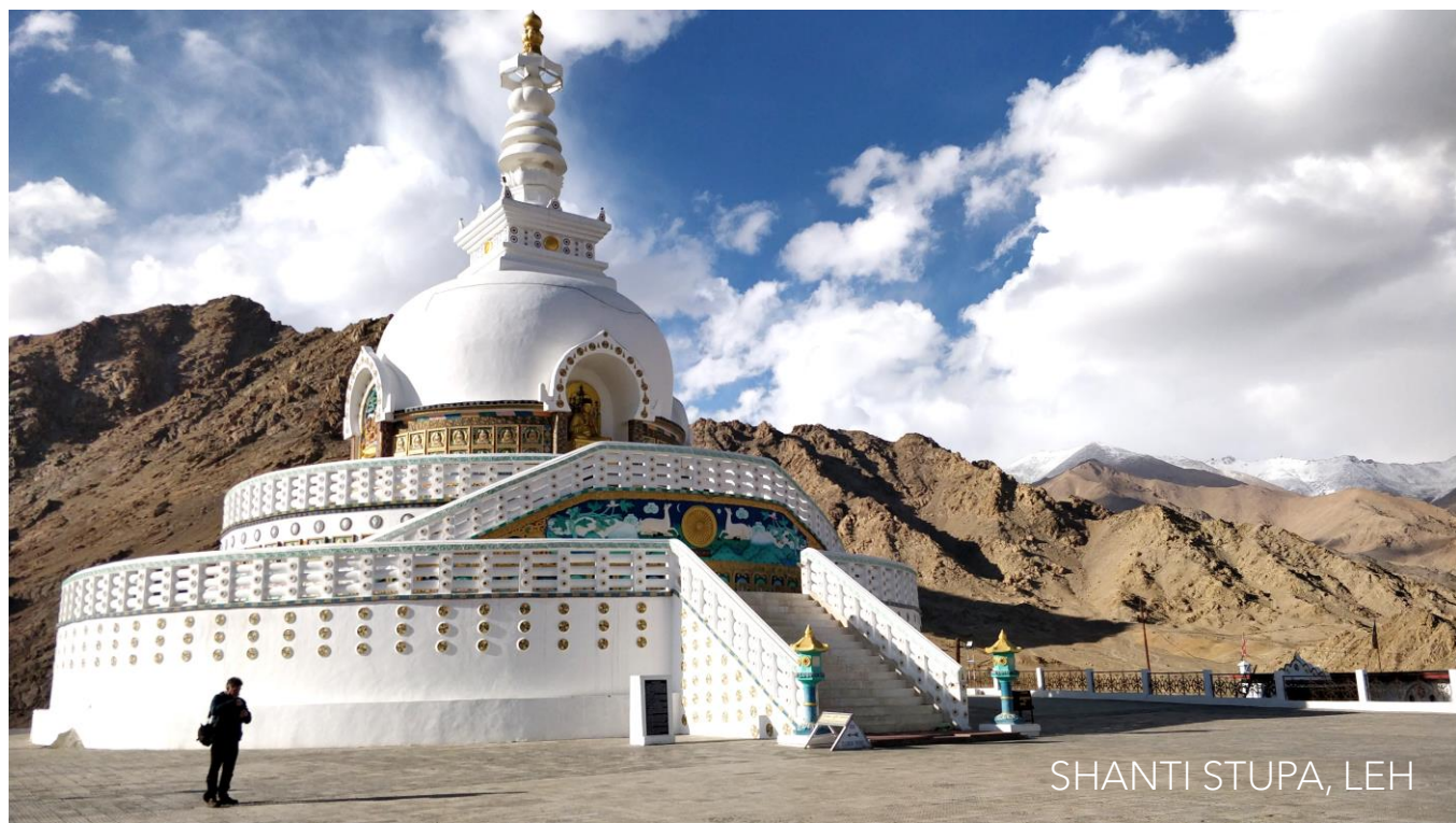
SHANTI STUPA, LEH