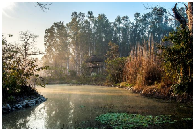
Waterhole with a Machan