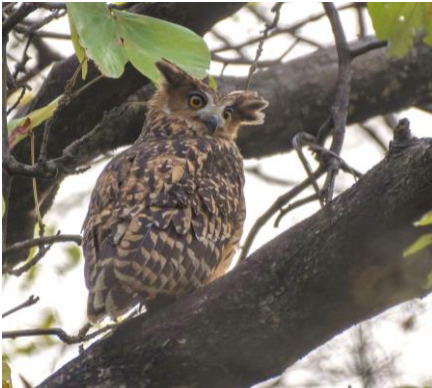
TAWNY FISH OWL