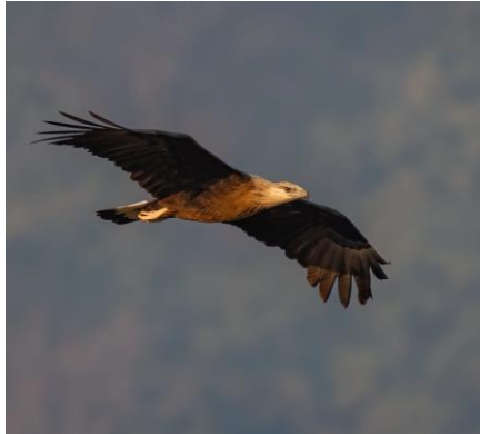
PALLAS FISH EAGLE