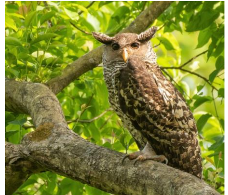
SPOT-BELLIED EAGLE OWL