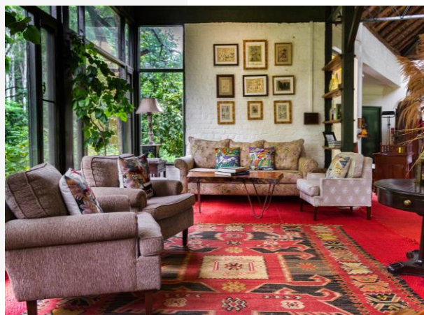
Lounge & Cafe